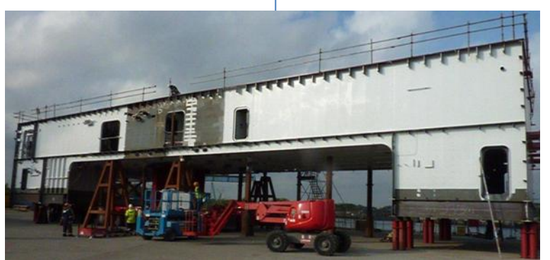
Ring J Units joined together on the West Quay