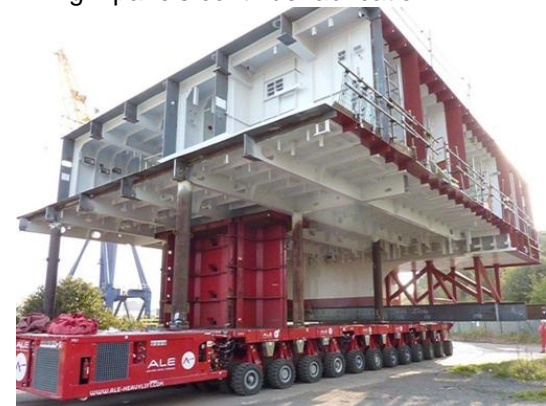
Ring J starboard on the move