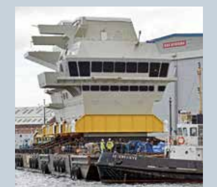
Forward island leaves Portsmouth

"What's more, this innovative design means that should either of the islands require repairs, the ship can be operated from the other, making them among the most flexible carriers on the seas."